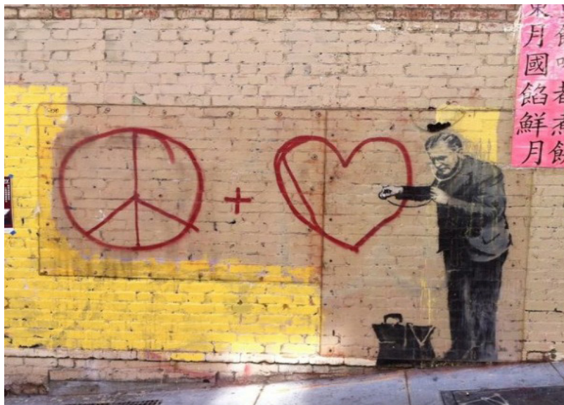
Banksy, health of peace and love, Chinatown, San Francisco.